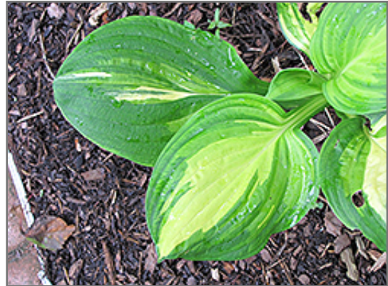
Center of Attention Hosta foliage