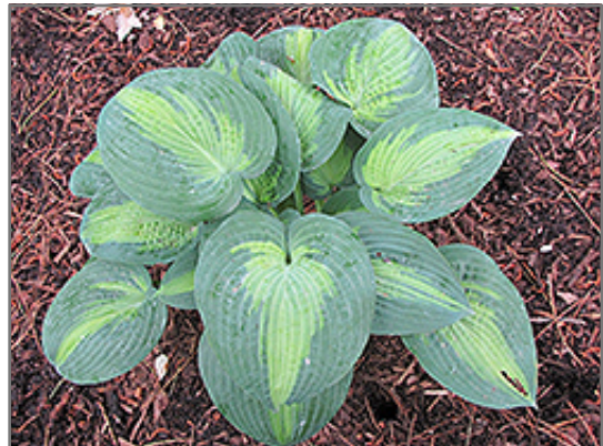
Blue Shadows Hosta