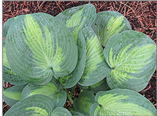
Blue Shadows Hosta foliage

Blue Shadows Hosta is recommended for the following landscape applications;