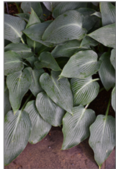
Blue Arrow Hosta foliage