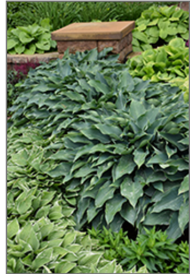
Blue Arrow Hosta

Blue Arrow Hosta is recommended for the following landscape applications;