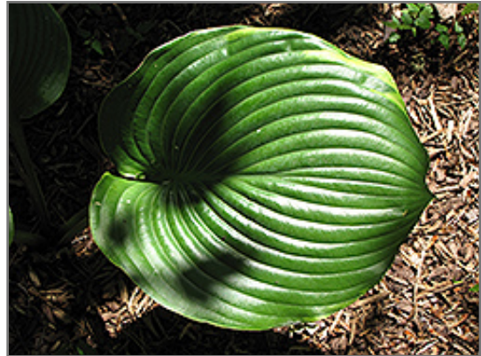
Beauty Substance Hosta foliage