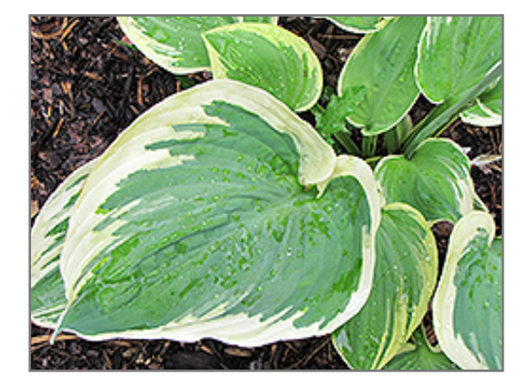
Band of Gold Hosta foliage

This is a relatively low maintenance plant, and is best cleaned up in early spring before it resumes active growth for the season. Gardeners should be aware of the following characteristic(s) that may warrant special consideration;