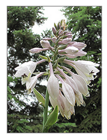
Band of Gold Hosta flowers