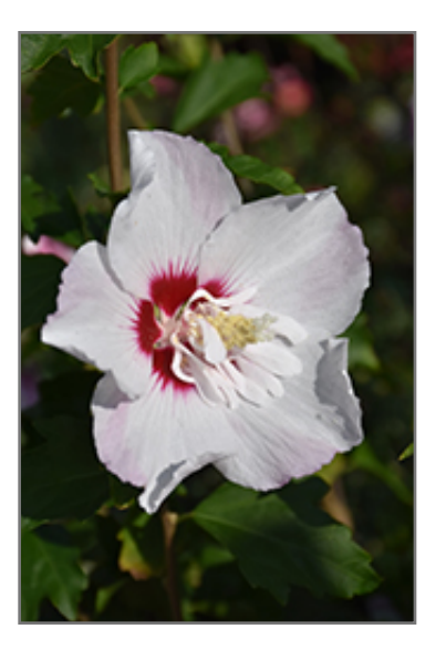
Fiji Rose of Sharon flowers

Outstanding semi-double blooms are soft pink with a deep red center; a tall, stiffly upright shrub with vase shape habit; extremely showy flowers throughout summer; very adaptable plant, but prefers full sun; can be trained into a small tree