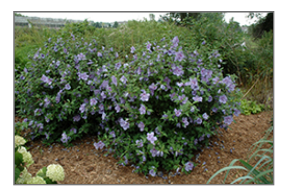
Blue Chiffon Rose of Sharon in bloom