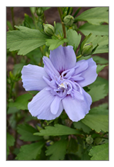
Blue Chiffon Rose of Sharon flowers

Blue Chiffon Rose of Sharon is a multi-stemmed deciduous shrub with an upright spreading habit of growth. Its average texture blends into the landscape, but can be balanced by one or two finer or coarser trees or shrubs for an effective composition.