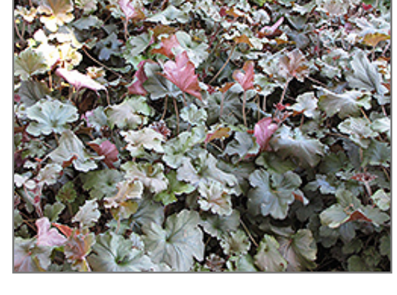
Cappuccino Coral Bells