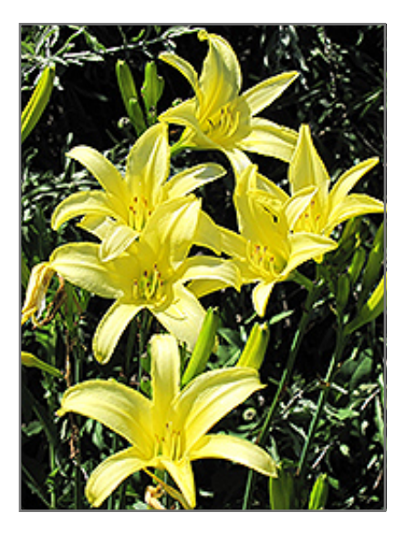
Tetrina's Daughter Daylily flowers

Pretty butter yellow trumpets with a bright yellow throat; provides a bold contrast to other plants; sturdy, strong, easy to care for, great grassy texture and form; a stunning display when massed in the garden