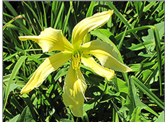
Spider Miracle Daylily flowers