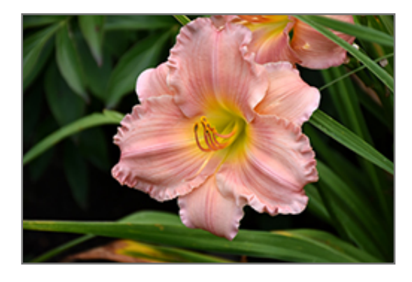
Jolyene Nichole Daylily flowers