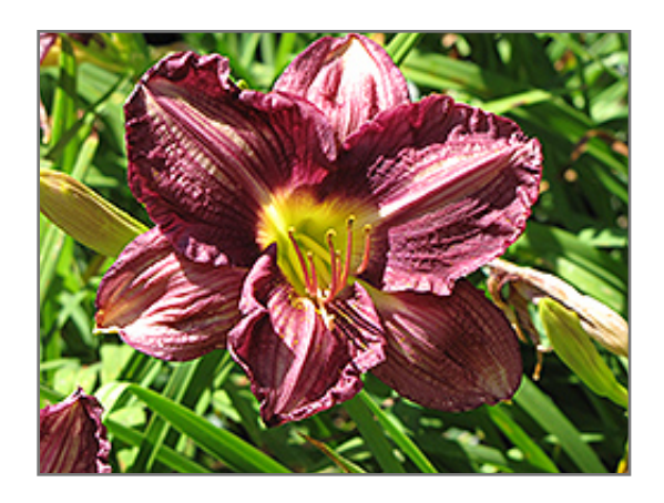
Hamlet Daylily flowers