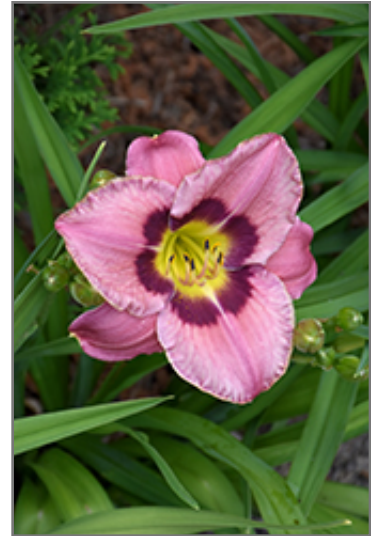
Always Afternoon Daylily flowers