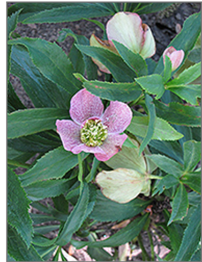
Winter Jewels Cherry Blossom Hellebore flowers

This is a relatively low maintenance plant, and should be cut back in late fall in preparation for winter. Deer don't particularly care for this plant and will usually leave it alone in favor of tastier treats. It has no significant negative characteristics.