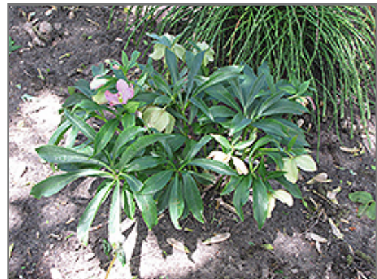
Winter Jewels Cherry Blossom Hellebore in bloom