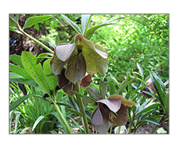
Harvington Shades of Night Hellebore flowers

Large dangling buttercup-type blooms are a deep purple-blue; one of the first flowers to come up in cool weather and what a beautiful harbinger they are; great in woodland gardens and on shaded slopes