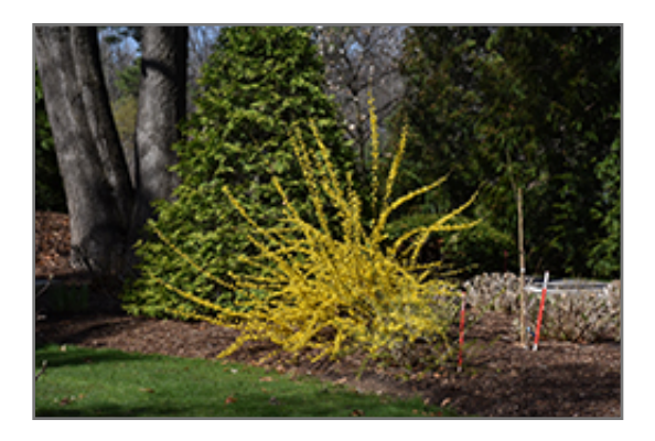
Show Off Forsythia in bloom