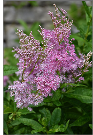
Venusta Queen Of The Prairie flowers

Venusta Queen Of The Prairie is recommended for the following landscape applications;