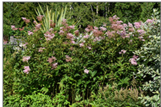
Venusta Queen Of The Prairie in bloom