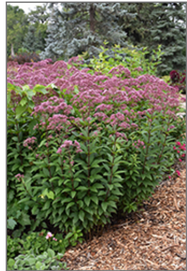
Joe Pye Weed in bloom

Joe Pye Weed is recommended for the following landscape applications;