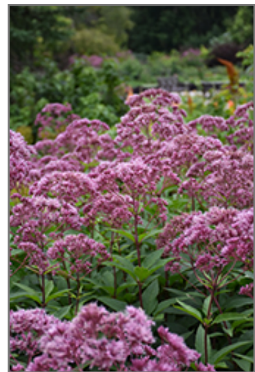
Joe Pye Weed flowers