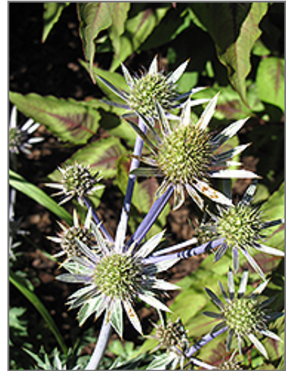
Mediterranean Sea Holly flowers