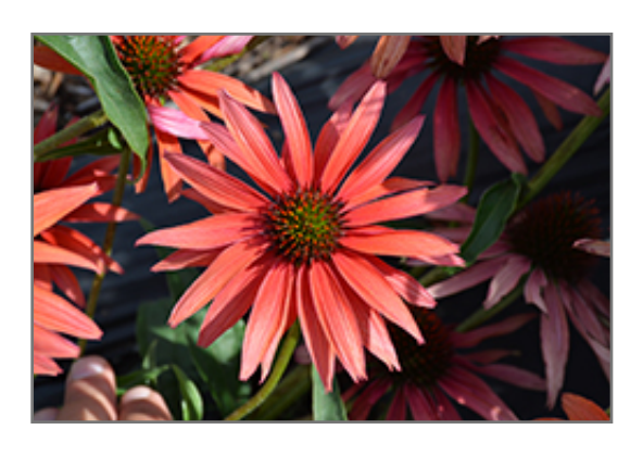
Hot Summer Coneflower flowers

This stunning echinacea produces attractive red-orange flowers with streaks of yellow; a perfect choice for planting in groups, along border edges, or in containers; great for flower arrangements, attracts pollinators