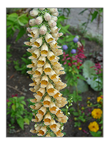
Grecian Foxglove flowers

Grecian Foxglove is recommended for the following landscape applications;