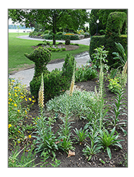
Grecian Foxglove in bloom