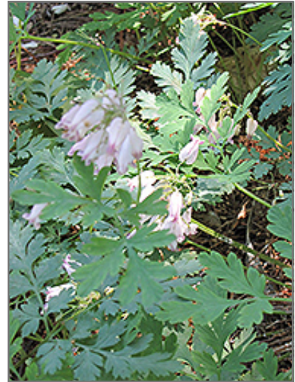
Stuart Boothman Bleeding Heart in bloom