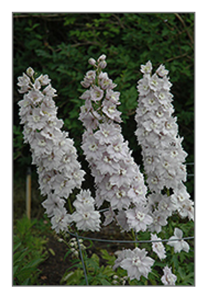
Double Innocence Larkspur flowers

A magnificent display of white double flowers on towering spikes with contrasting apple-green bee; good vertical form, dense flower spikes and strong stems; excellent uniformity