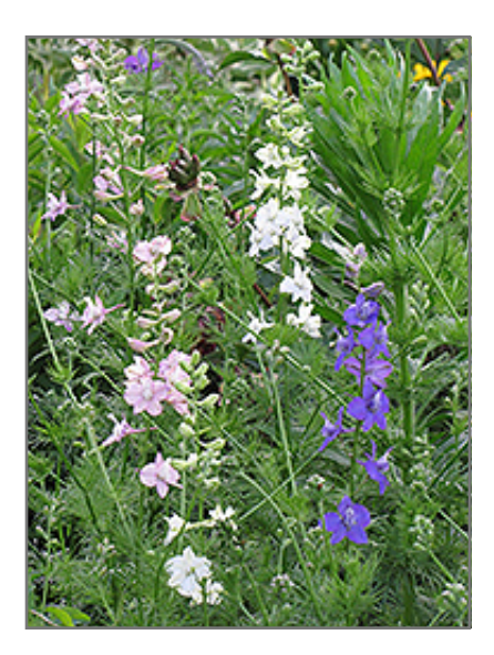
Rocket Larkspur in bloom

Rocket Larkspur is recommended for the following landscape applications;