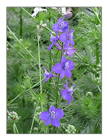
Rocket Larkspur flowers