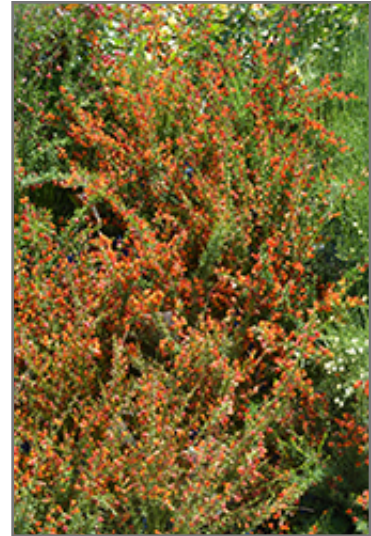
Lena Scotch Broom in bloom

This shrub should only be grown in full sunlight. It prefers dry to average moisture levels with very well-drained soil, and will often die in standing water. It is considered to be drought-tolerant, and thus makes an ideal choice for xeriscaping or the moisture-conserving landscape. It is particular about its soil conditions, with a strong preference for clay, alkaline soils, and is able to handle environmental salt. It is highly tolerant of urban pollution and will even thrive in inner city environments. This particular variety is an interspecific hybrid.