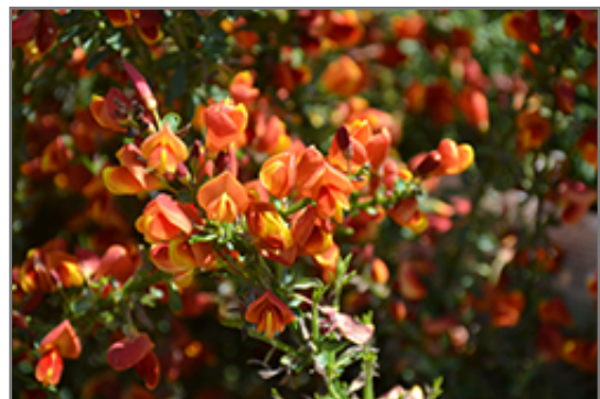
Lena Scotch Broom flowers