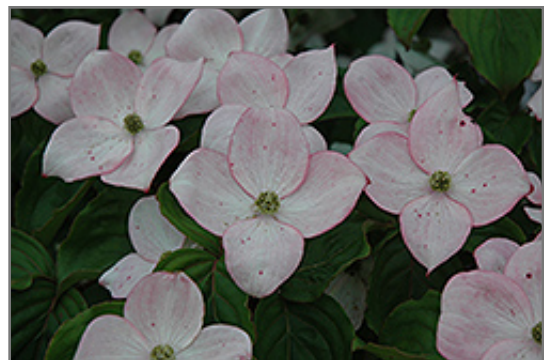
Flowering Dogwood flowers