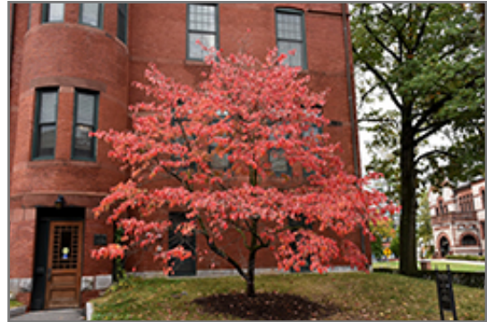
Flowering Dogwood in fall

This tree does best in full sun to partial shade. You may want to keep it away from hot, dry locations that receive direct afternoon sun or which get reflected sunlight, such as against the south side of a white wall. It requires an evenly moist well-drained soil for optimal growth, but will die in standing water. It is very fussy about its soil conditions and must have rich, acidic soils to ensure success, and is subject to chlorosis (yellowing) of the foliage in alkaline soils. It is quite intolerant of urban pollution, therefore inner city or urban streetside plantings are best avoided, and will benefit from being planted in a relatively sheltered location. Consider applying a thick mulch around the root zone in winter to protect it in exposed locations or colder microclimates. This species is native to parts of North America.