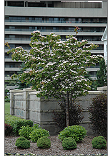
Flowering Dogwood in bloom

This is a relatively low maintenance tree, and should only be pruned after flowering to avoid removing any of the current season's flowers. It is a good choice for attracting birds to your yard. Gardeners should be aware of the following characteristic(s) that may warrant special consideration;