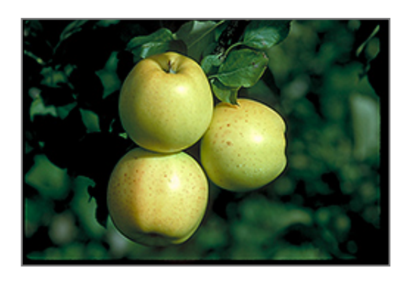
Honeygold Apple fruit

This is a deciduous tree with a more or less rounded form. Its average texture blends into the landscape, but can be balanced by one or two finer or coarser trees or shrubs for an effective composition. This is a high maintenance plant that will require regular care and upkeep, and is best pruned in late winter once the threat of extreme cold has passed. Gardeners should be aware of the following characteristic(s) that may warrant special consideration;