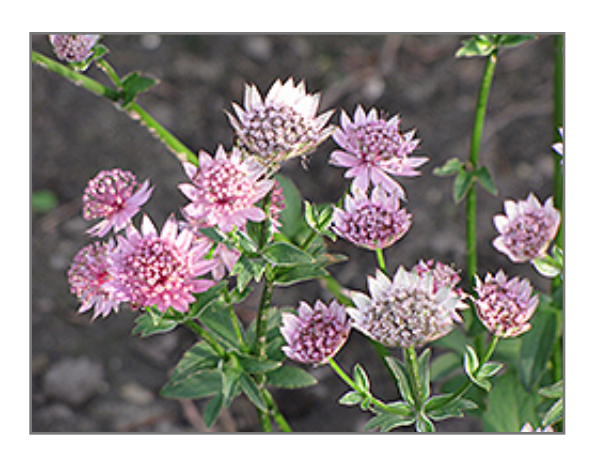
Primadonna Masterwort flowers