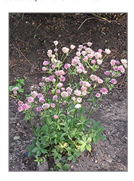
Primadonna Masterwort in bloom