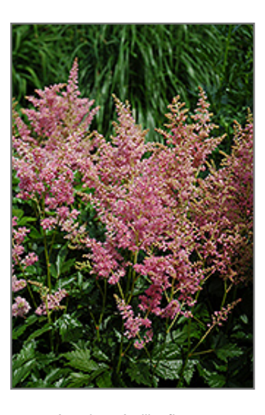
Amethyst Astilbe flowers

Lovely lilac-mauve colored plumes rising above lacy delicate leaves; perfect in a shady spot with dappled light; prefers moisture so water regularly for abundant flowers and nice foliage