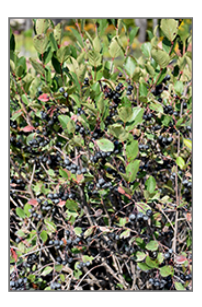
Black Chokeberry fruit