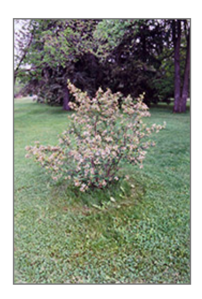
Black Chokeberry in bloom