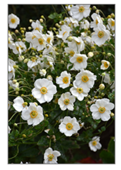
Honorine Jobert Anemone flowers