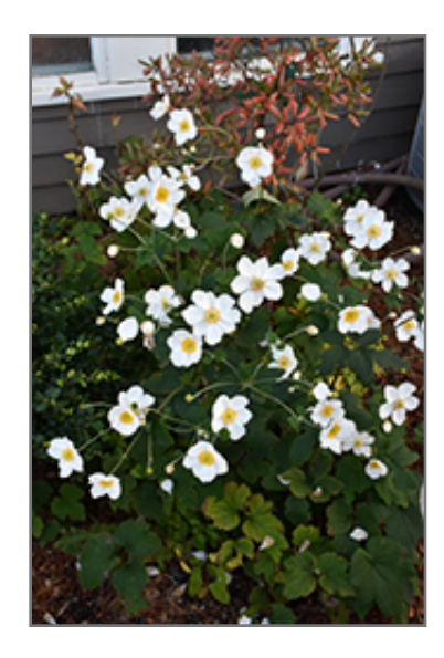
Honorine Jobert Anemone in bloom