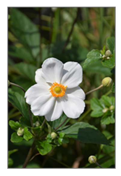
Honorine Jobert Anemone flowers

Honorine Jobert Anemone is a fine choice for the garden, but it is also a good selection for planting in outdoor pots and containers. With its upright habit of growth, it is best suited for use as a 'thriller' in the 'spiller-thriller-filler' container combination; plant it near the center of the pot, surrounded by smaller plants and those that spill over the edges. It is even sizeable enough that it can be grown alone in a suitable container. Note that when growing plants in outdoor containers and baskets, they may require more frequent waterings than they would in the yard or garden. Be aware that in our climate, most plants cannot be expected to survive the winter if left in containers outdoors, and this plant is no exception. Contact our experts for more information on how to protect it over the winter months.