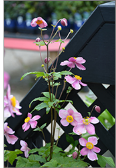
September Charm Anemone flowers

September Charm Anemone is a fine choice for the garden, but it is also a good selection for planting in outdoor pots and containers. With its upright habit of growth, it is best suited for use as a 'thriller' in the 'spiller-thriller-filler' container combination; plant it near the center of the pot, surrounded by smaller plants and those that spill over the edges. It is even sizeable enough that it can be grown alone in a suitable container. Note that when growing plants in outdoor containers and baskets, they may require more frequent waterings than they would in the yard or garden. Be aware that in our climate, most plants cannot be expected to survive the winter if left in containers outdoors, and this plant is no exception. Contact our experts for more information on how to protect it over the winter months.