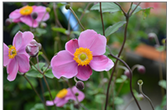
September Charm Anemone flowers