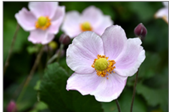
September Charm Anemone flowers

September Charm Anemone is recommended for the following landscape applications;