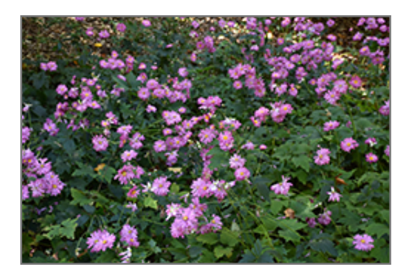
Prince Henry Anemone in bloom

This is a relatively low maintenance plant, and is best cleaned up in early spring before it resumes active growth for the season. Deer don't particularly care for this plant and will usually leave it alone in favor of tastier treats. It has no significant negative characteristics.