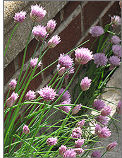
Giant Chives in bloom