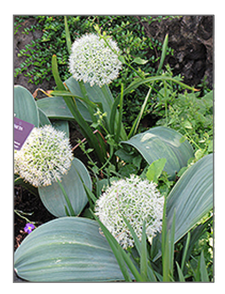
Ivory Queen Ornamental Onion in bloom

Beautiful white globe flowers emerge from strappy blue-green foliage in mid to late spring; attracts butterflies; plant close together for an impressive massed effect