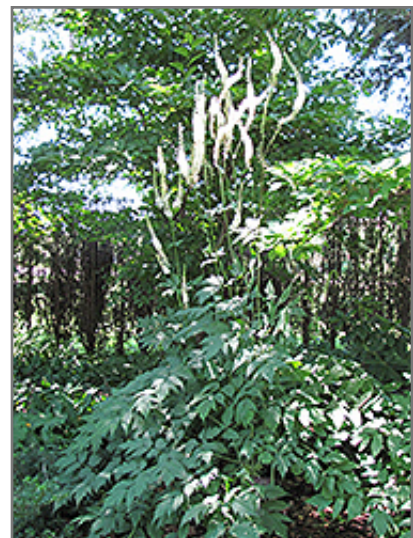
Mountain Bugbane in bloom