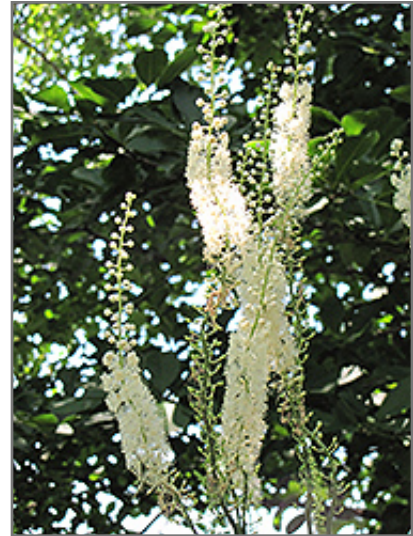
Mountain Bugbane flowers