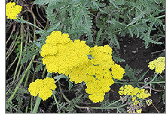
Cloth of Gold Fernleaf Yarrow flowers

This tall growing varrow has fern-like foliage that creates a visually fine mound; the golden yellow flowers are arranged in corymbs and adorn the top of the stems; a wonderful border planting; stunning when massed