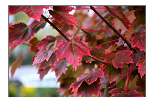
Brandywine Red Maple in fall