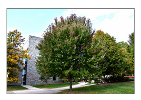
Brandywine Red Maple

This tree does best in full sun to partial shade. It prefers to grow in average to moist conditions, and shouldn't be allowed to dry out. It is not particular as to soil type, but has a definite preference for acidic soils, and is subject to chlorosis (yellowing) of the foliage in alkaline soils. It is somewhat tolerant of urban pollution. This is a selection of a native North American species.