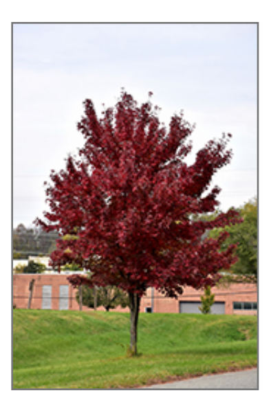
Brandywine Red Maple in fall