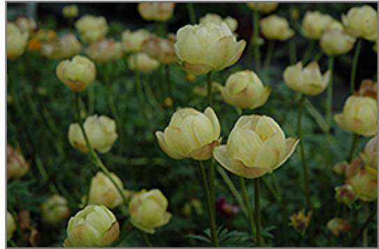
Cheddar Globeflower flowers