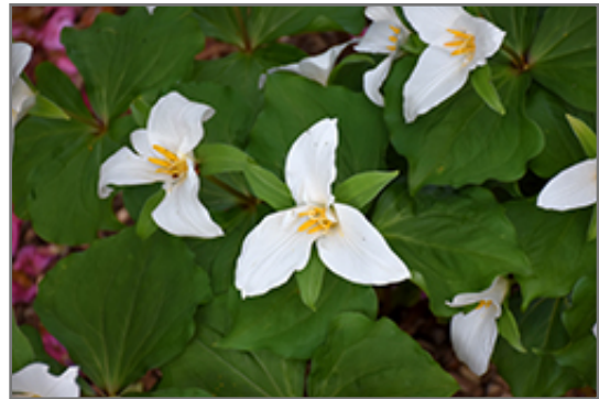
Western Trillium flowers