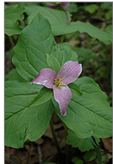
Western Trillium flowers (faded)