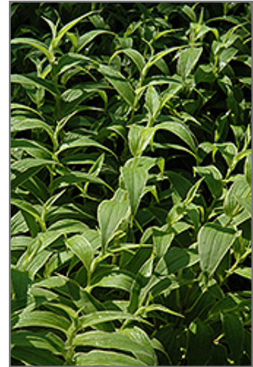
Variegated Toad Lily foliage