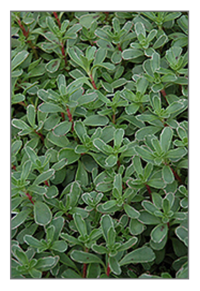
Variegated Stonecrop foliage

This variety contributes seasonal color as well as evergreen cover; green leaves are edged in white, with pink highlights; masses of rich pink blooms in summer; this mat forming groundcover is ideal for the rock garden or the front of a sunny border