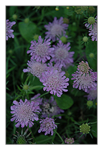
Misty Butterflies Dwarf Pincushion Flower flowers

This variety is a low tufted or mounding perennial with taller stems that bear small lacy pincushion flowers of lilac blue or sometimes pink; long blooming and perfect for edging, rock gardens, or containers