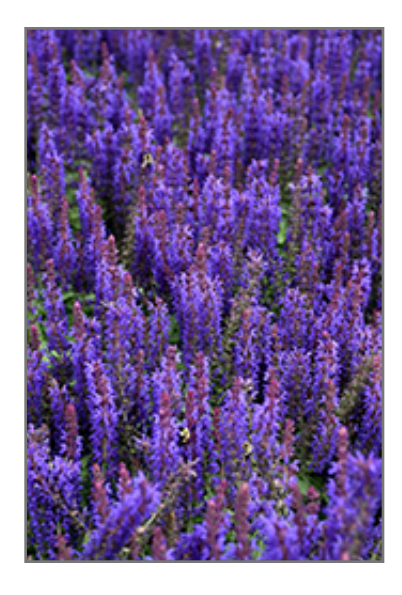
Sensation Deep Blue Sage flowers

Sensation Deep Blue Sage is recommended for the following landscape applications;