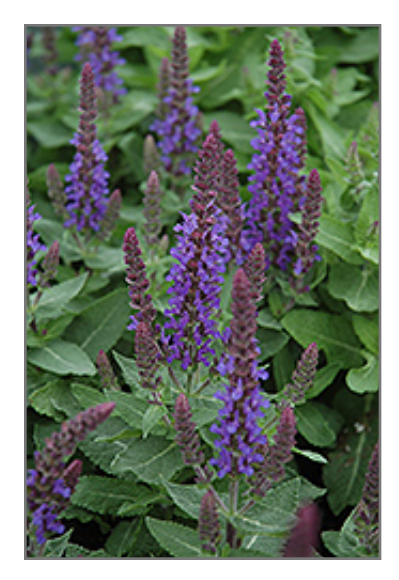
Sensation Deep Blue Sage flowers