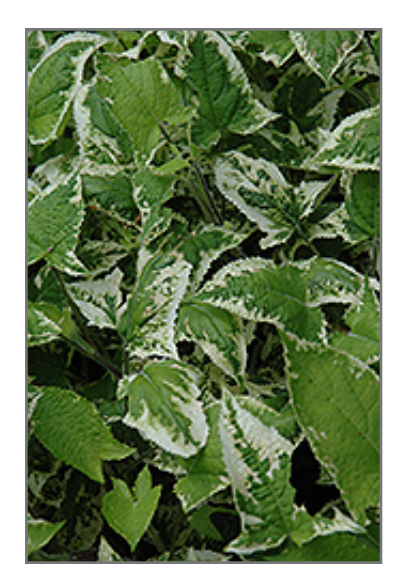
Fuji Snow Variegated Japanese Sage foliage

Fuji Snow Variegated Japanese Sage is an herbaceous perennial with tall flower stalks held atop a low mound of foliage. Its relatively fine texture sets it apart from other garden plants with less refined foliage.