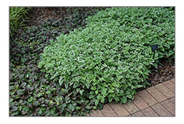
Fuji Snow Variegated Japanese Sage