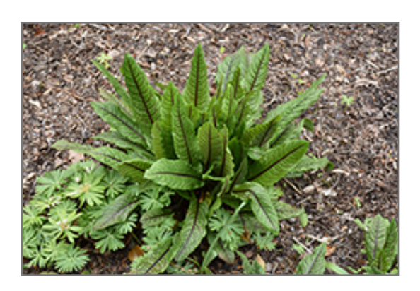
Ornamental Sorrel

Ornamental Sorrel is recommended for the following landscape applications;