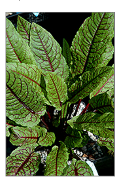
Ornamental Sorrel foliage