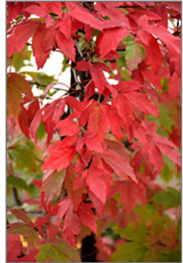
Paperbark Maple in fall

This tree does best in full sun to partial shade. It prefers to grow in average to moist conditions, and shouldn't be allowed to dry out. It is not particular as to soil type or pH. It is somewhat tolerant of urban pollution. This species is not originally from North America.