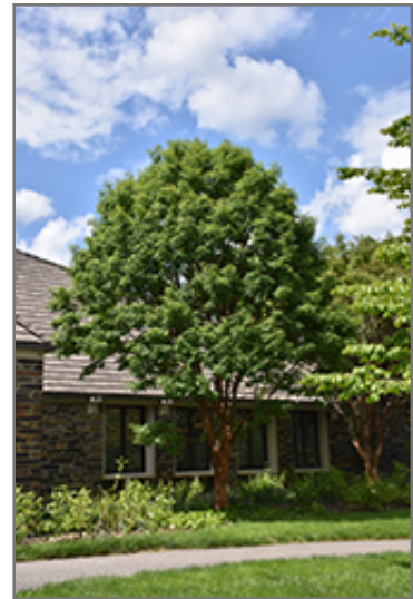
Paperbark Maple